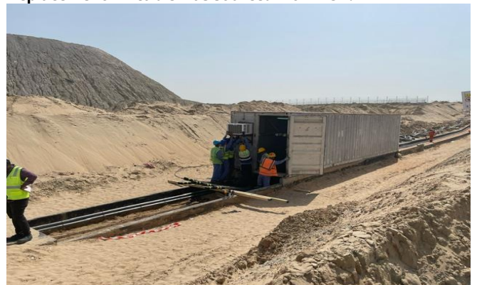
Cable jointing is carried out in special shelters to protect sensitive equipment.

For more details about the WWMC project, to request information or to raise a grievance please email us at info@wwmc.ae .