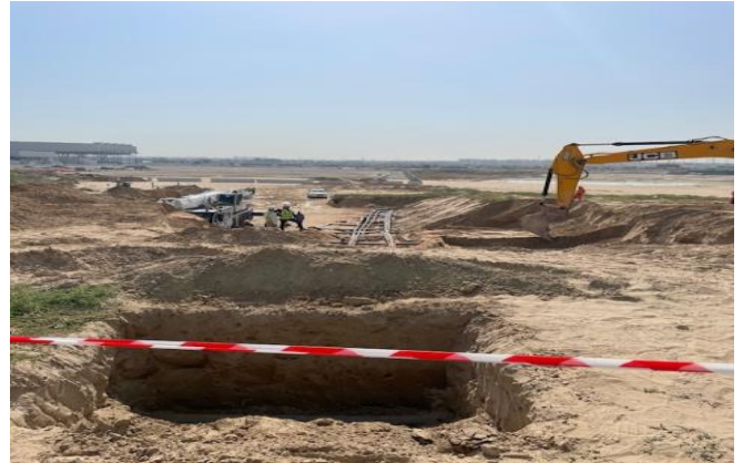
Excavations to expose damaged cables and troughs

As we celebrate our third anniversary, let's reflect on our resilience and commitment to overcoming challenges, knowing that together, we can accomplish anything.