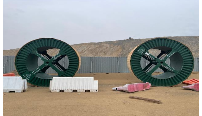
Replacement HV cable was sourced from KSA.