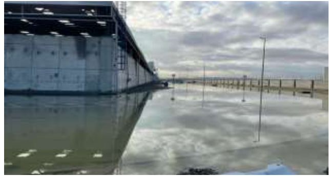
Site roads were flooded and impassable during the storm.