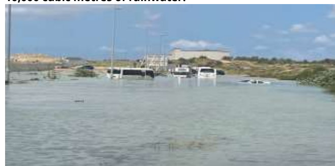
The site access road was completely flooded with many vehicles abandoned.