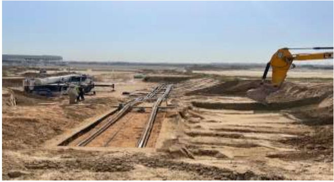
Works to repair the damaged cables were started in the last week of April.

We expect to complete repairs within May and resume full power export in June, and we are still targeting full commercial operations on 2<sup>nd</sup> July. For more details about the WWMC project, to request information or to raise a grievance please email us at info@wwmc.ae.