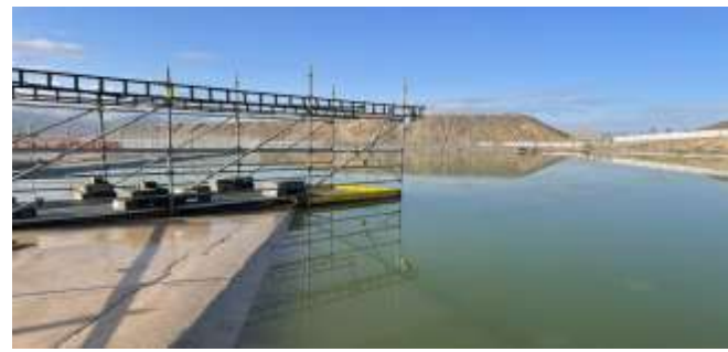
The plant stormwater reservoir did its job, collecting nearly 10,000 cubic metres of rainwater.