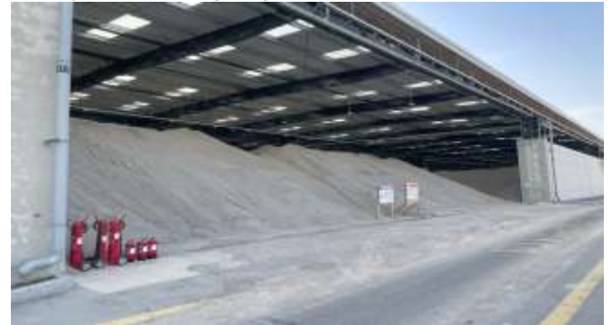
Stock levels of matured IBA await collection by DM

environmental regulator this month. This is a requirement of EOP2 and marks the successful completion of tuning and testing our boiler's flue gas treatment systems. Since we began receiving municipal solid waste in April 2023, nearly 1,000,000 tons have been delivered to site for incineration, and to date we have remained compliant with all emissions standards. The erection of the remaining section of the security fence to the south of site will commence early in April, as DM have completed the removal of waste from the adjacent landfill site and have backfilled the land. Completion of the outstanding snagging works (Punchlist) is progressing well and the handover of remaining 'As Built' documentation from EPC for plant equipment and systems is ongoing.