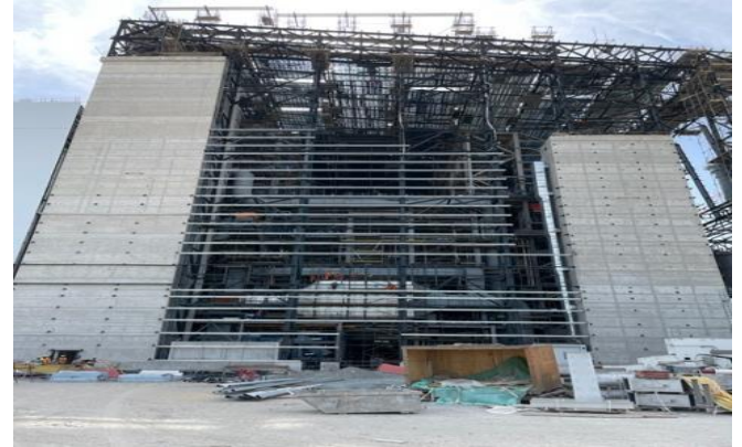
The remaining construction works in the boiler hall are at the western end of block 2

system installation is underway, and MEP snagging in the technical block is nearing completion.