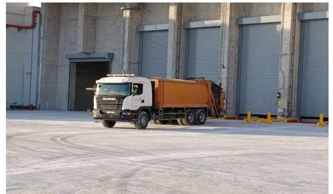
A waste compactor vehicle maneuvers on the tipping floor in preparation for waste discharge into bunker 1.

The DWE plant is receiving municipal solid waste (MSW) from domestic and commercial locations across the Emirate of Dubai. A proportion of this waste includes metals, both ferrous and non ferrous, from discarded products. The IBA sorting area is fitted with equipment to separate out and harvest these metals from the ash stream, using magnetic and electronic devices, plus manual hand picking stations. Metals recovered are stored in skips and DWMC is developing business arrangements for the resale and recycling of these products, which will include the reforming and re-use of metallic goods within the Emirate of Dubai.